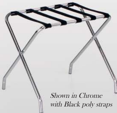
#805 Overall Dimensions: 30"W (76 cm) 24"D (61 cm) 25.5"H (65 cm)