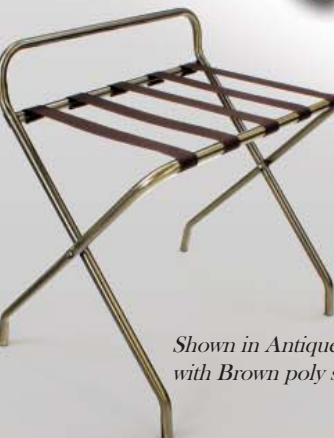
#807 Overall Dimensions: 30"W (76 cm) 23"D (58 cm) 31.5"H (80 cm)

Shown in Antique Brass with Brown poly straps