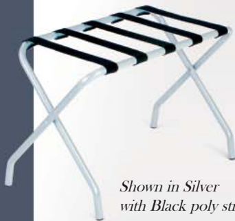
#803 Overall Dimensions: 30"W (76 cm) 18"D (46 cm) 20.5"H (52 cm)