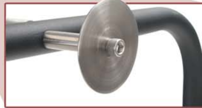
Round Tube Superstructure