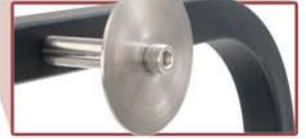
Square Tube Superstructure

#H1205 Square tube superstructure with 6" flat free wheels