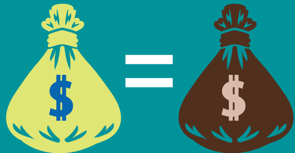
FORBES METAL CART

The initial purchase price of both a Forbes Metal Housekeeping Cart and the leading plastic cart are comparable.