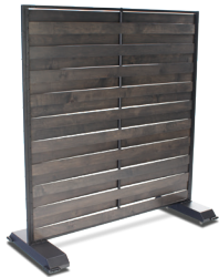
Mobile Wall Partitions