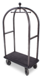
Luggage Carts & Bellman Equipment