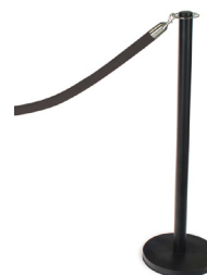
Public Guidance Systems