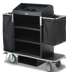
Housekeeping, Laundry & Linen Carts