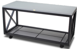
Mobile Action Stations