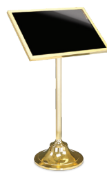
Signage, Easels & Flip Charts