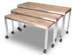
Mobile Nesting Tables