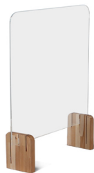
Health & Safety