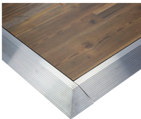
Portable Dance Floors