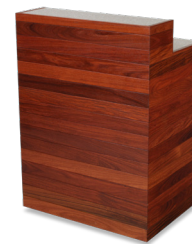
Podiums & Host Stations