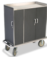
Service Carts & Equipment