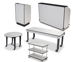
Express Line Ships in one week