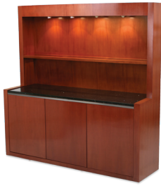
Mobile Back Bars