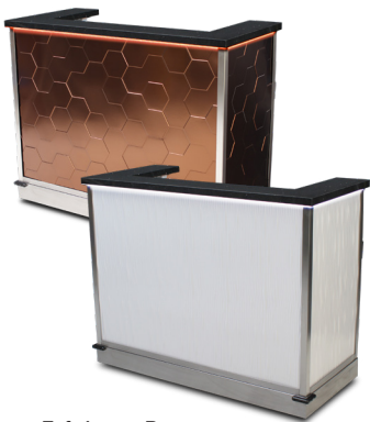
5-ft Long Bar