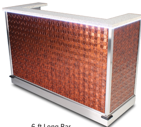
6-ft Long Bar