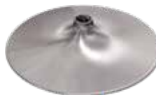
Brushed Nickel Trumpet Base*