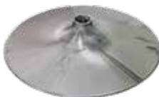
Polished Chrome Trumpet Base*