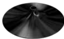
Black Trumpet Base*