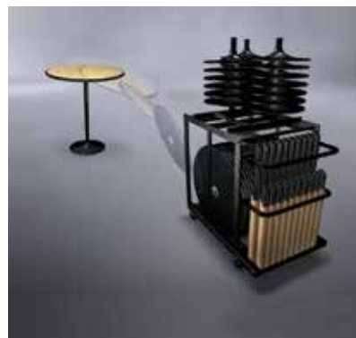
TABLE TOP SIZES