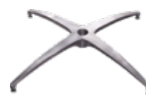
Brushed Silver X-Base