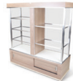
Mobile Back Bars