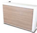
Mobile Front Bars